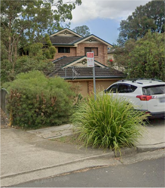
1 STREETScape VIEW